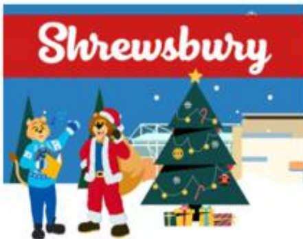
Christmas Holiday Club - Shrewsbury